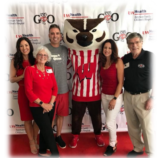
The Hildebrandt Family