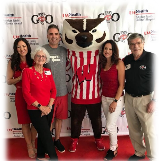
The Hildebrandt Family