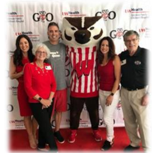
The Hildebrandt Family